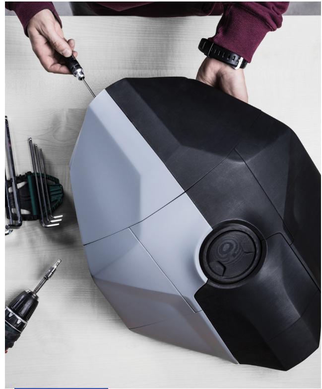
A full scale prototype of a motorbike fuel tank 3D printed on Zortrax M300 Plus with Z-HIPS.