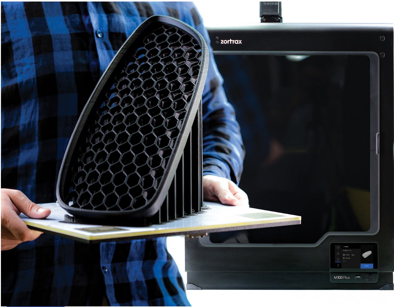
A full scale prototype of an automobile front grill element 3D printed on Zortrax M300 Plus in one go.